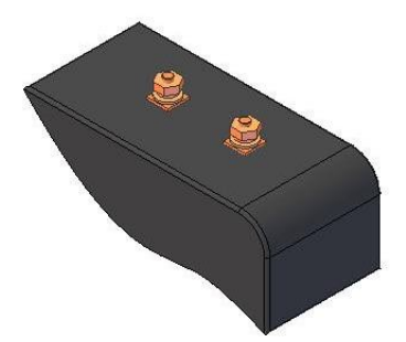
T = Male Terminals